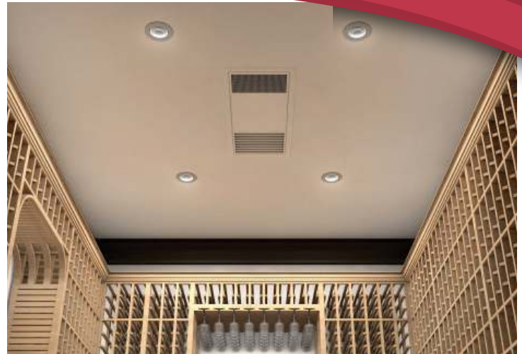
* Front grille and mounting bracket have been painted to match the ceiling